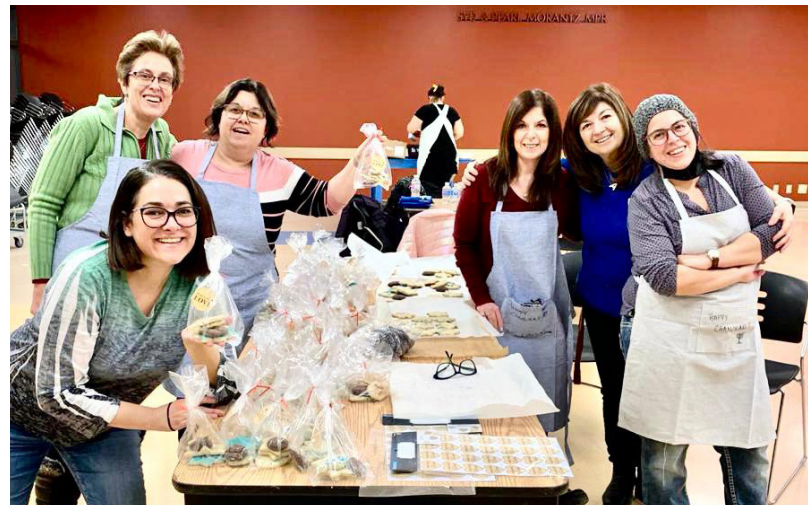
Our Volunteers come together throughout the year to bake tasty treats for those in our community