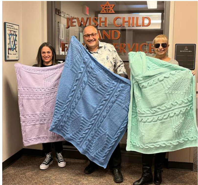
Our friends at Etz Chayim did a "knitvah" project for JCFS! The sisterhood knitted us lovely (and warm) blankets for JCFS families.